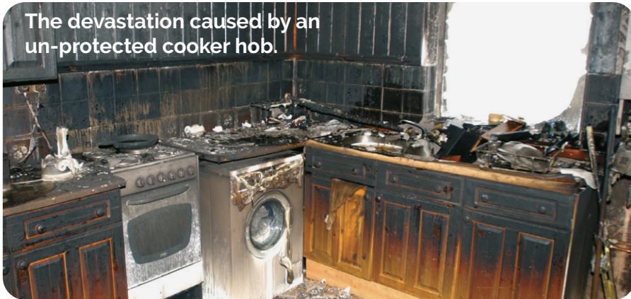
The devastation caused by an un-protected cooker hob.

A cost effective, safe and easy to install automatic fire suppression system for Residential properties, Care Homes and Student accommodation.